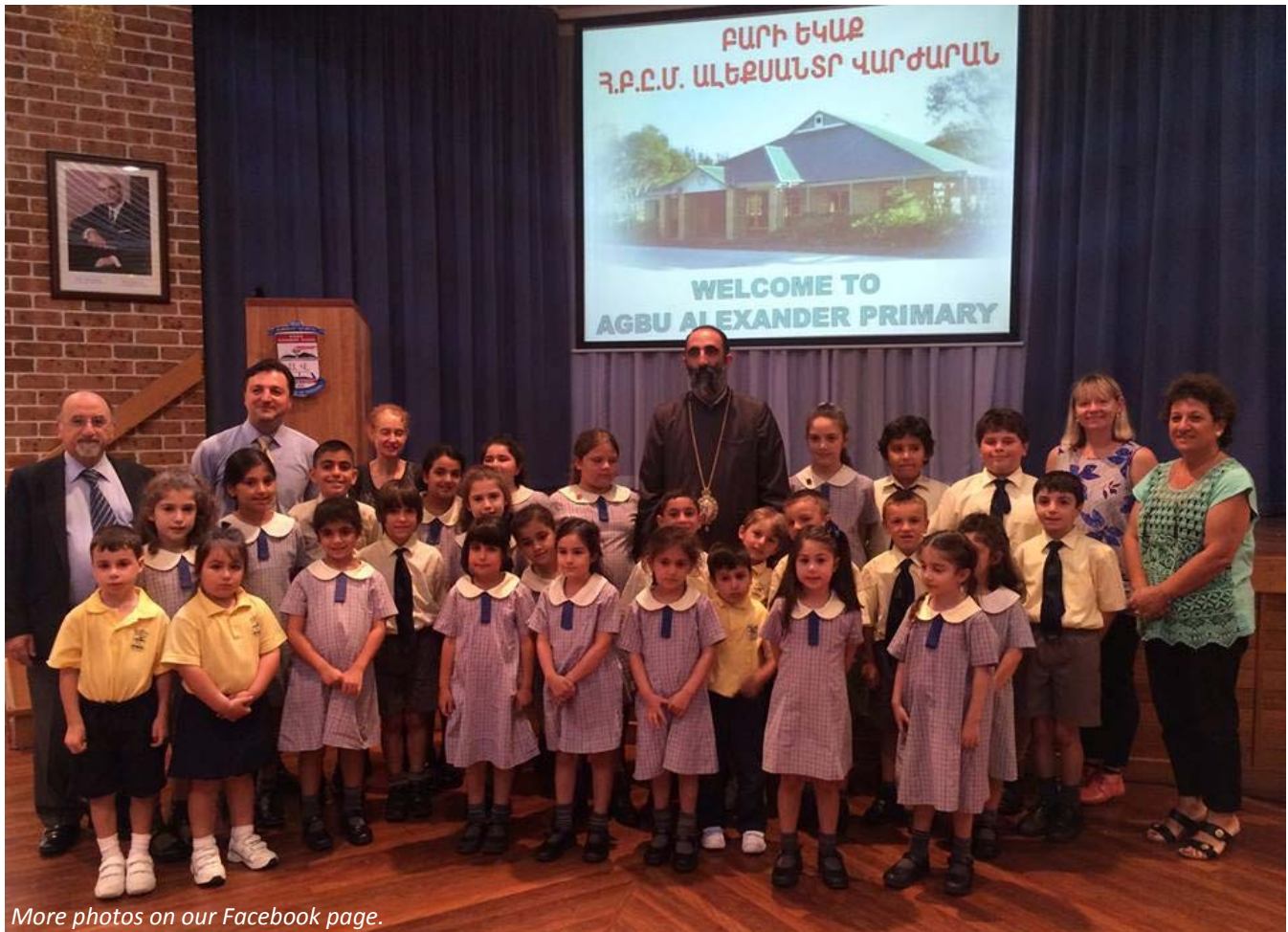
More photos on our Facebook page.