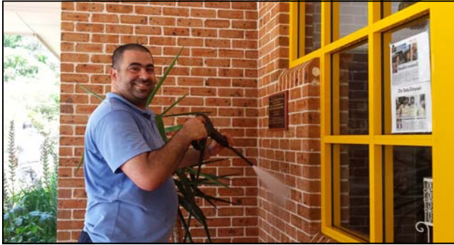
Photo Gallery - Working Bee